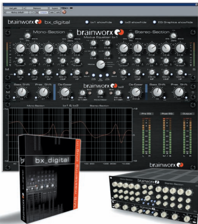
bx_digital & the analog bx1 Mastering EQ