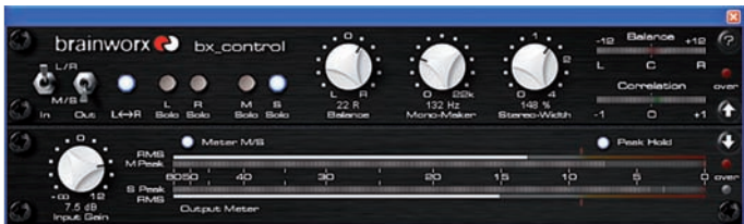
bx_control - Screenshot